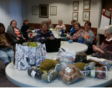
Tight Knit celebrates two years together!