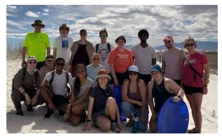
White Sands National Park