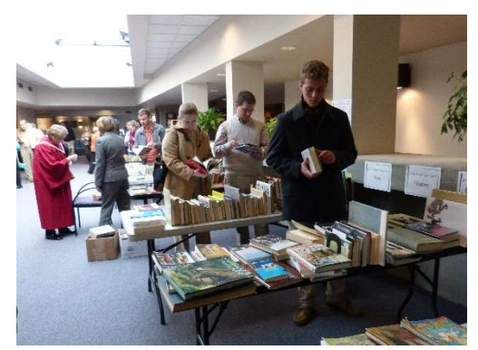
The last Library book sale was held in 2018.

Children's books are always popular, but we have only a few books for our youngest readers. So, we decided to try something new so our children can be involved. Anyone who donates a children's book in good condition can select any book in the sale for free. Children can "trade" a book they have outgrown for something new and exciting. Please put your name on any children's books you leave in the library (or office) so we can keep a record of who receives free books.